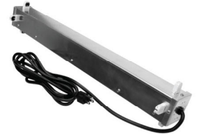
FloroFresh 424 X1