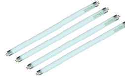
2' AgroMax T5 UV-C Bulbs X4