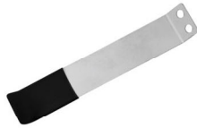
6" Duct Tension Legs X8