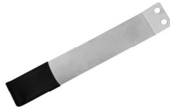
8" Duct Tension Legs X8